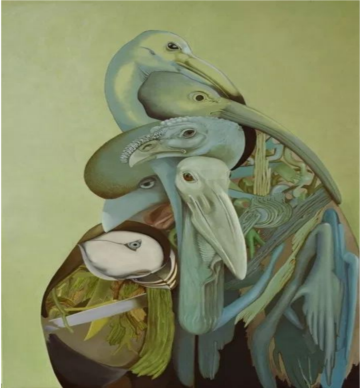
Silvia Stocchetto: Totem (2016).