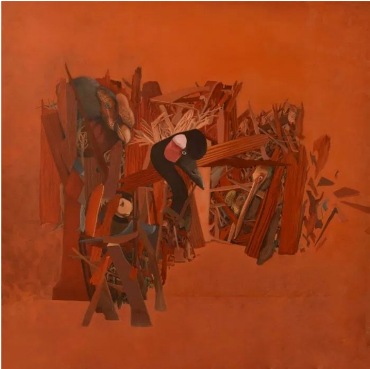
Silvia Stocchetto: La gru coronata (2016).

single entity with the figurative elements. The earthy colours and the shades of green are anchors of reality. These colours represent our origins and at the same time they serve as a kind of allusion to the unknown and the impenetrable in nature.