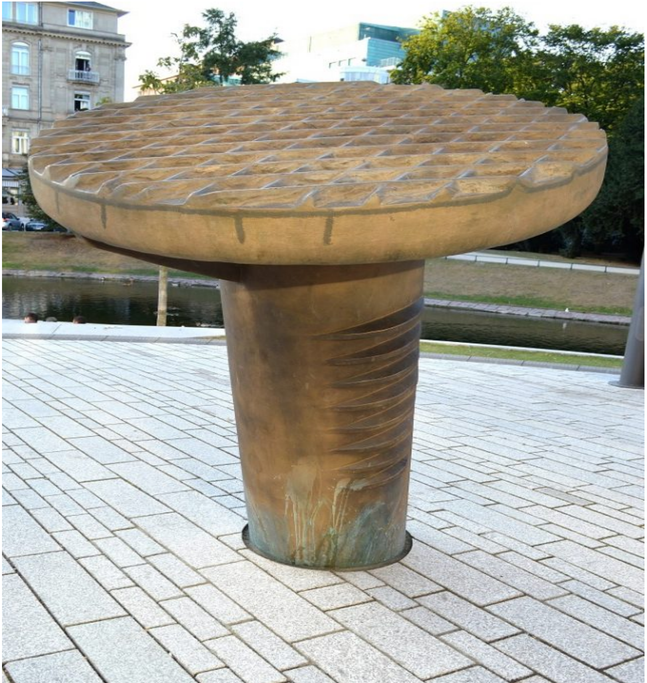
Günther Uecker: Nagel, 2013

In addition to expression of personal life experiences in their work, artists often show a high sensibility for innovative ways of thinking in society, being able to foresee and understand the Zeitgeist and to participate in its manifestation. Well known examples of political engagement of artists are environmental themes elaborated by Joseph Beuys and H.A. Schult or the graffiti art of Harald Naegeli who sprays drawings on public buildings as a protest against inhuman living environments.