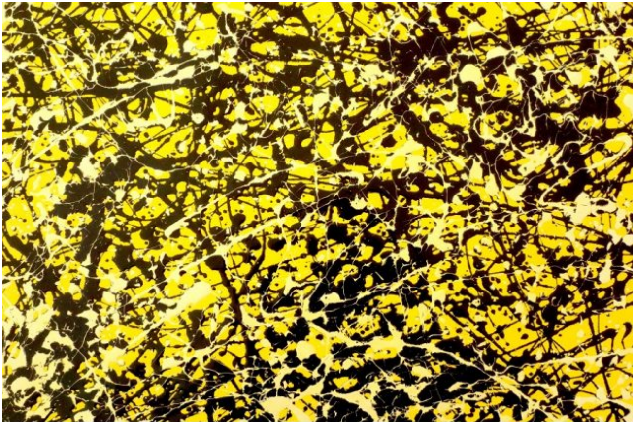
Multihorizonte, Lack auf Papier - 2013

from orbit into colourful abstract paintings[24].